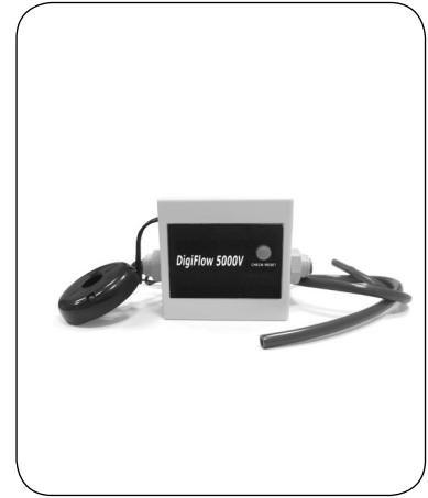
Capacity Monitor Kit (Install with Below-Sink Kit)