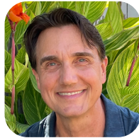
Optimal Health California