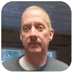
Up North Sales