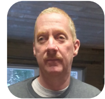
Up North Sales Michigan