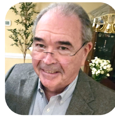
Water 2 Drink