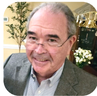
Water 2 Drink Virginia