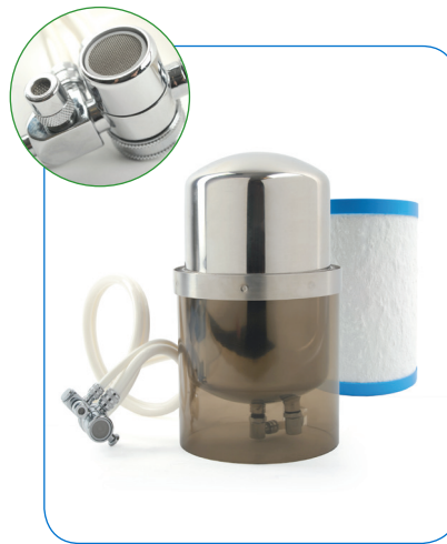
Countertop Kit (Dual-hose Diverter Valve Included)