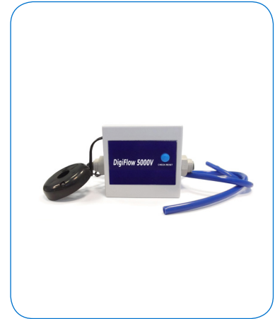
Capacity Monitor Kit (Install with Below-Sink Kit)