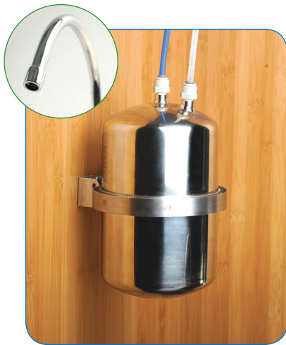
Below-Sink Kit (Faucet Included)