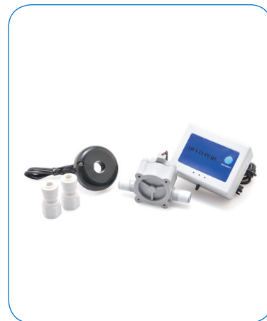
Capacity Monitor Kit (Install with Below-Sink Kit)