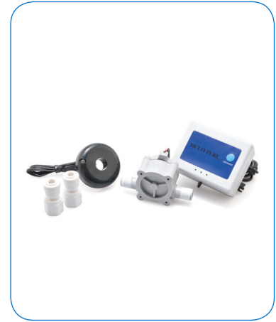
Capacity Monitor Kit (Install with Below-Sink Kit)