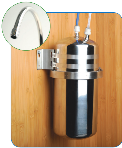
Below-Sink Kit (Faucet Included)