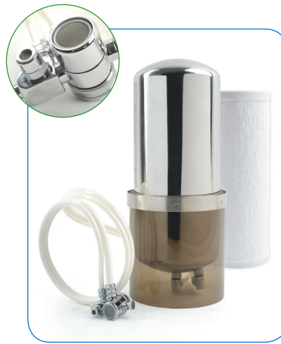
Countertop Kit (Dual-hose Diverter Valve Included)