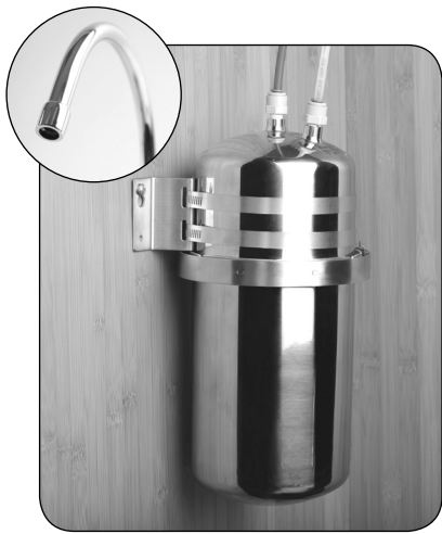
Below-Sink Kit (Faucet Included)