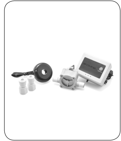
Capacity Monitor Kit (Install with Below-Sink Kit)