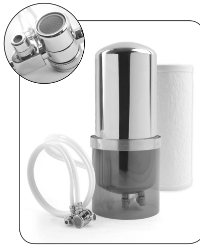
Countertop Kit (Dual-hose Diverter Valve Included)